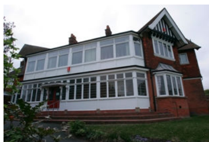
The Primary Department Broadstairs →

Kent County Council would like to hear your views on a proposal to relocate Laleham Gap (Community Special) School into purpose-built buildings on a single site at Newlands Lane, Broadstairs